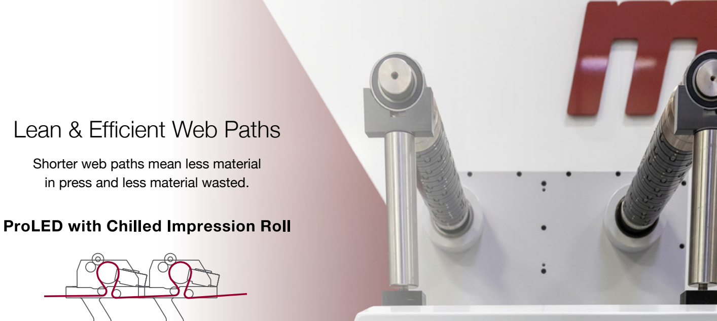
Shortest web path — 53 inch (135 cm) between print heads.